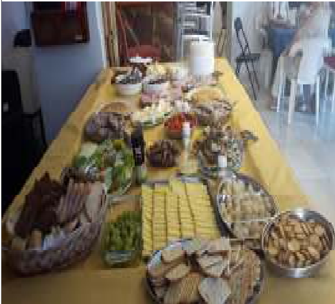
Sumptuous buffet laid out on the pool table ready for the start