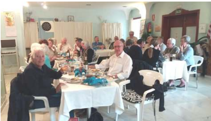
Centre and bottom left various Members enjoying the Harvest Festival / Thanksgiving meal