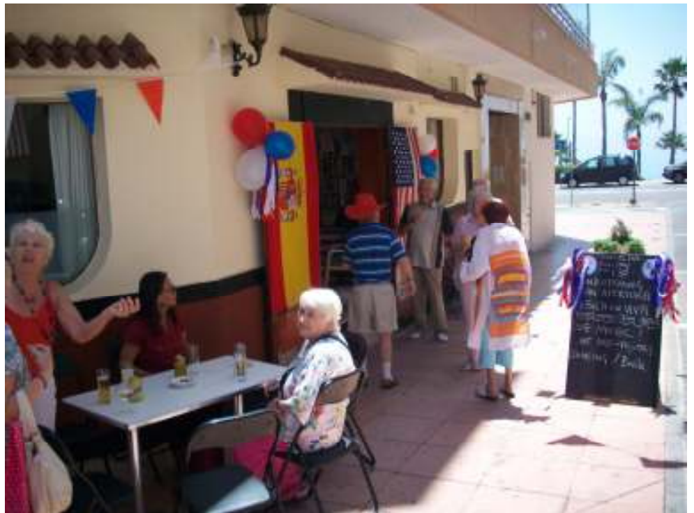
Including tables and parasols outside