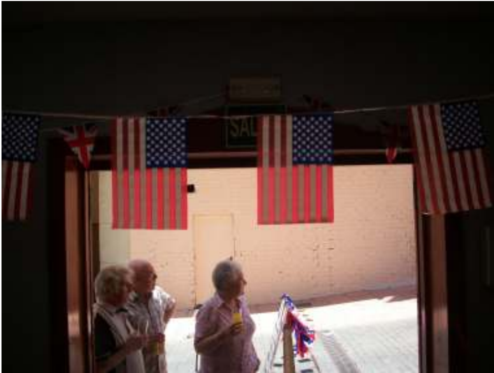
The Club was decorated throughout