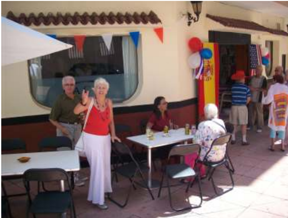
Half an hour to the expected arrival of the Mayor of Estepona and the club is getting busier