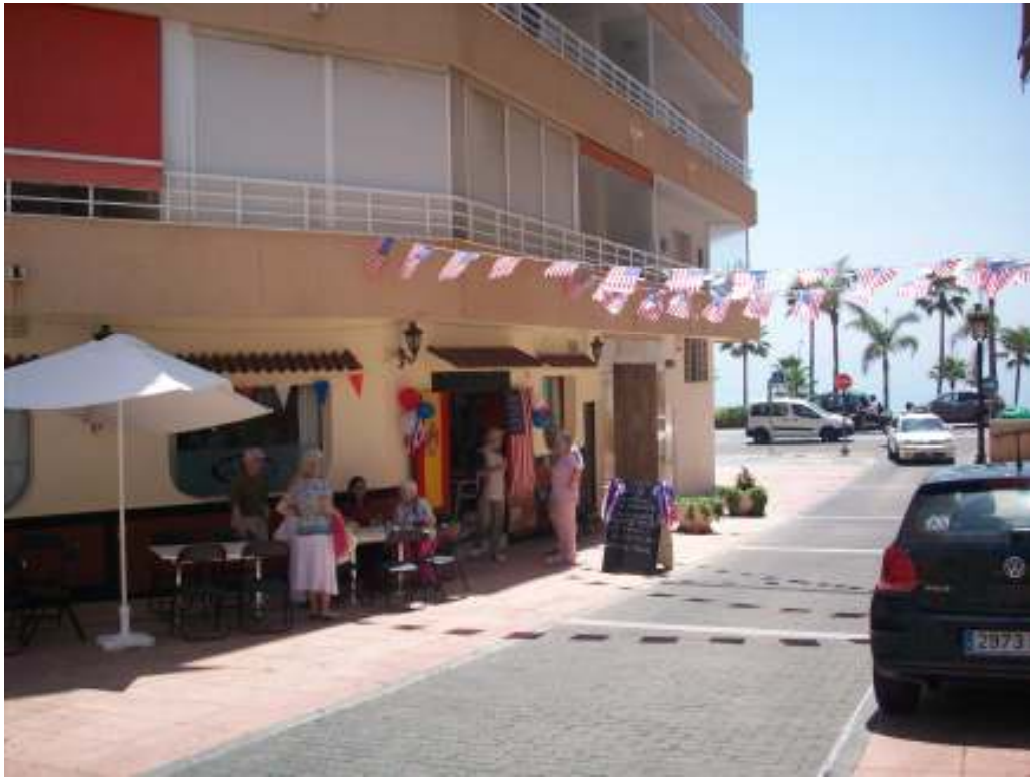
No shortage of flags and bunting