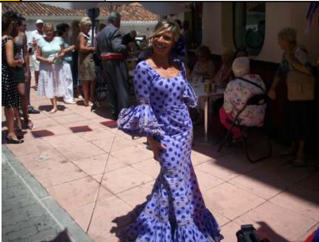
The T.V. crew arrives from Estepona Televisión. This is their interviewer!