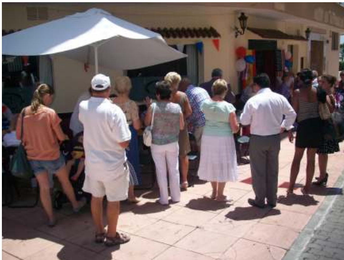
Getting closer to the time of official opening