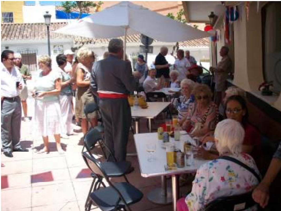
Outside beginning to fill up